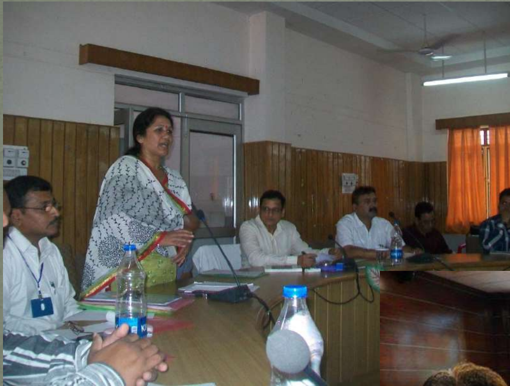
Briefing Power Sector PSUs at NDMA ( National Disaster Management Authority ) Meet New Delhi